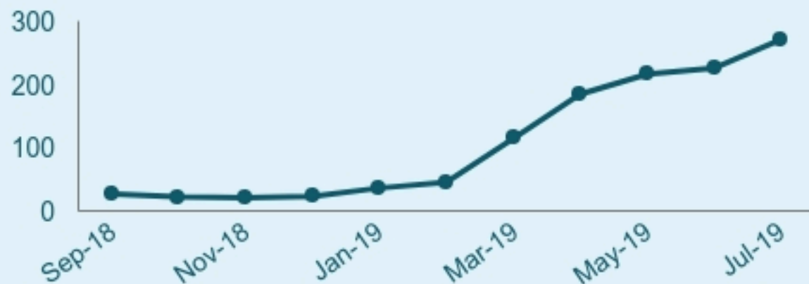
Average views per day

"Saves time being able to access GP record, especially medications."