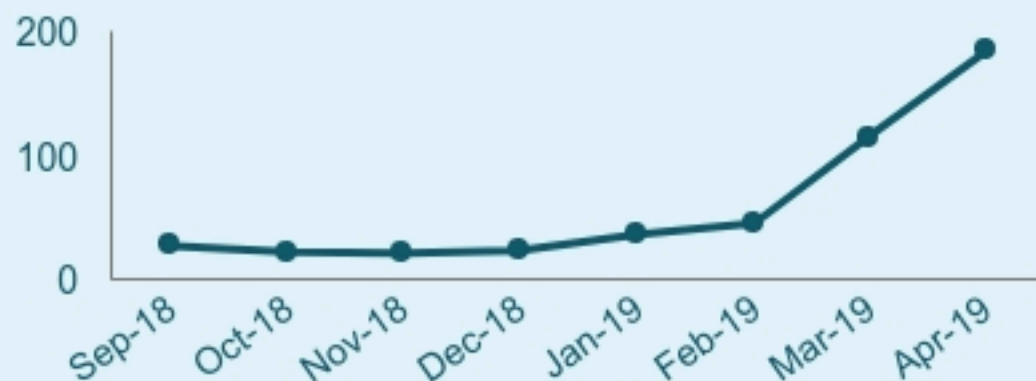
Average views per day

3 data feeds live • Mental health • Community • GP data